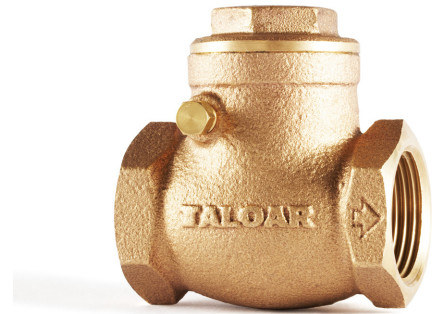
C107 1/2" - 4"